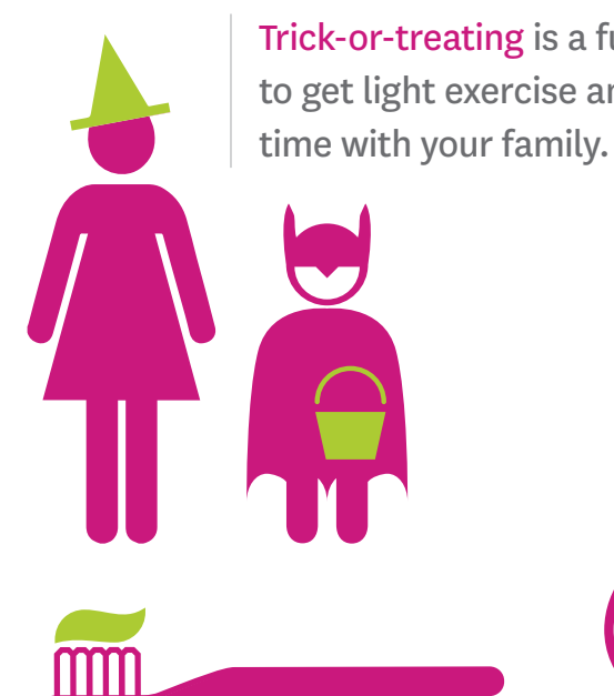
Trick-or-treating is a fun way to get light exercise and spend

Halloween is the perfect time for fun activities with your family and friends. Whether you're carving pumpkins or sharing candy, you can create special moments that will last long after the witching hour. Just keep these helpful tricks in mind to have a happy and healthy Halloween.